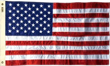
United States Flag