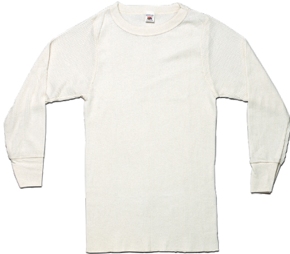
Color: White or Natural