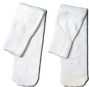
Color: White or off White