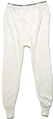
Color: White or Natural