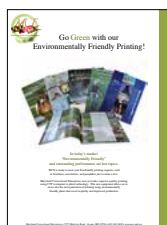
Environmentally Friendly Printing