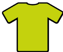
(Limited to Certain Products) 200 ANSI-III HIVIS Lime Yellow