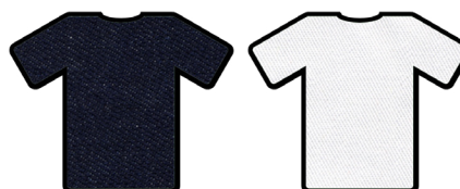
090 Indigo Blue