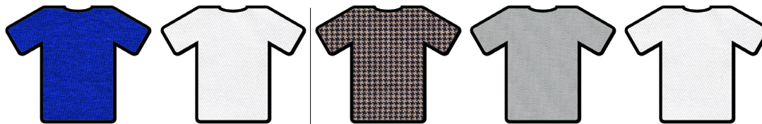
178 Royal Blue