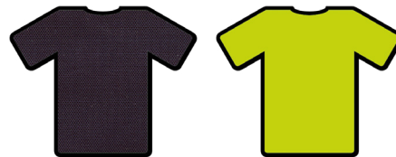
135 Midnight Navy